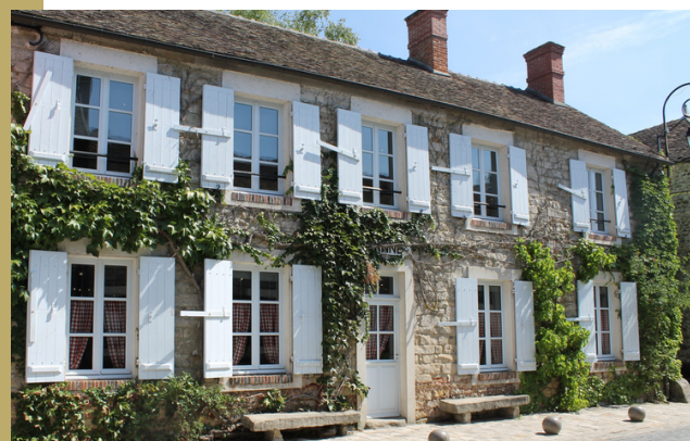
Barbizon painter's museum