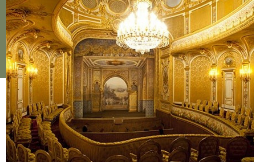
Château de Fontainebleau