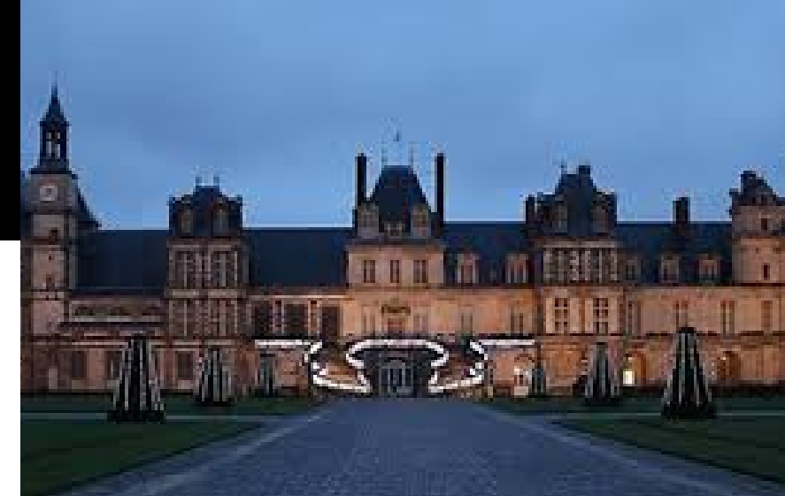
Château de Fontainebleau